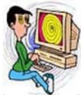
Late night 'coding'