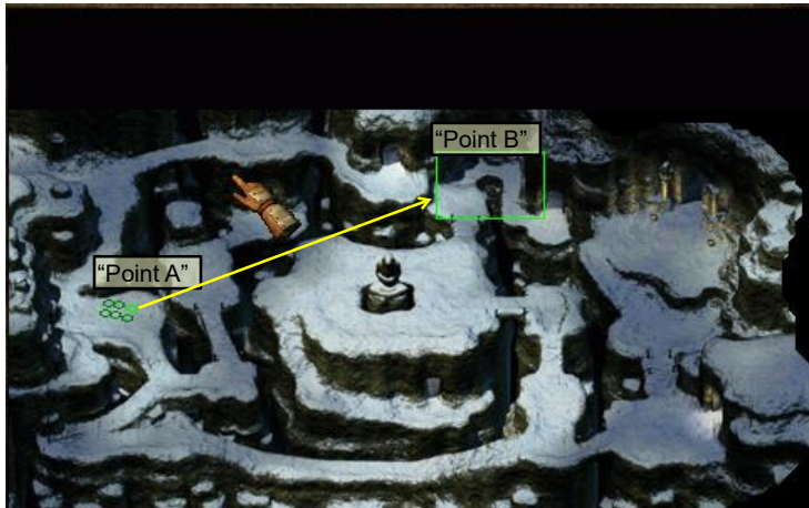
Icewind Dale © Black Isle