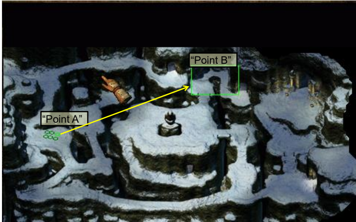
Icewind Dale © Black Isle