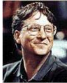
Bill Gates, Chairman and Chief Software Architect of Microsoft™