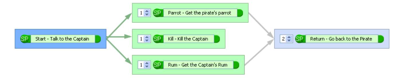
Figure 2: A story involving a pirate and the various story points that need to be reached in order to complete it.