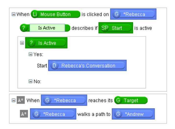
Figure 4: Two causes created with the Unity Translator.

Many events in Unity occur by checking conditions in methods that are updated at different times, such as during each frame of the game or each physics time step. If causes were built this way, there would only be a few causes and users would need to write a description and a question every time they are used. Although the translator provides this functionality, we have also included high level causes that simplify the game authoring process. For example, instead of creating a question to determine if the mouse has been clicked in the "when game frame updates" cause, the user can use a "when mouse is clicked" cause. This approach allows authors to create stories more quickly, while still supporting the flexibility of Unity's API for power users. Figure 4 shows two causes form a simple Unity story in ScriptEase. It uses a more abstract "when mouse is clicked" cause and also uses an A* pathfinding library in addition to the main Unity library.